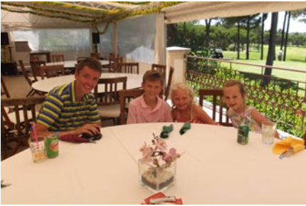
Junior Open lunch