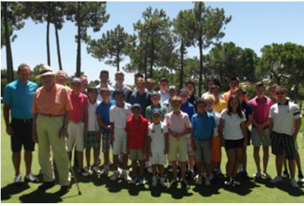
Junior Open participants