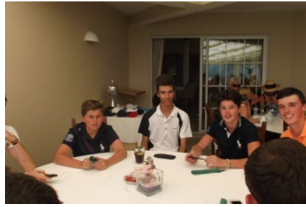
Junior Open lunch