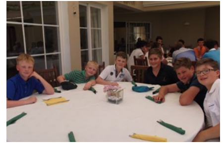
Junior Open lunch